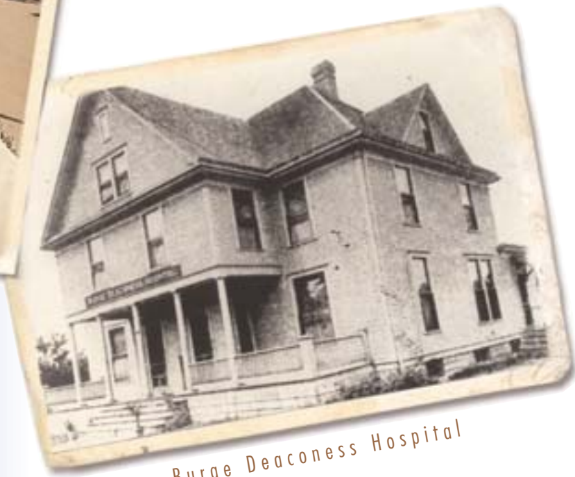
Burge Deaconess Hospital

the Glouser Oncology Fund, gives newly diagnosed cancer patients an immediate contact person who can help them find answers to financial questions, emotional issues, support services and additional information on their disease. The value of this program is described this way by one cancer patient: