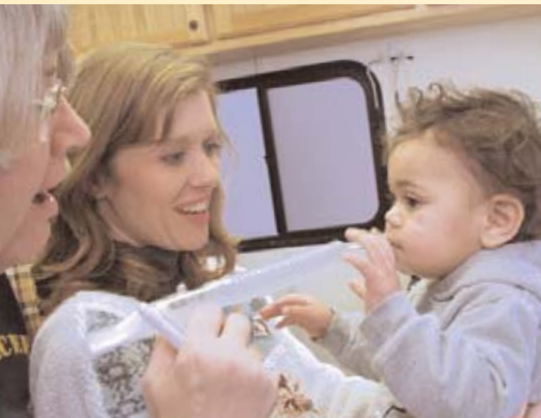
The CMN C.A.R.E. Mobile is a clinic on wheels that offers free health services to children birth to age 17.