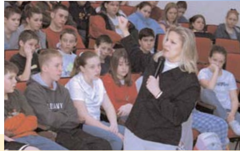
Thanks to CMN, WASTED, an anti-drinking and driving campaign, is presented free to area students.